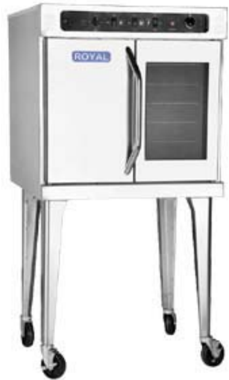
RECO-1 Shown With Optional Casters