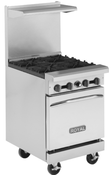
RR-4 Shown With Optional Casters