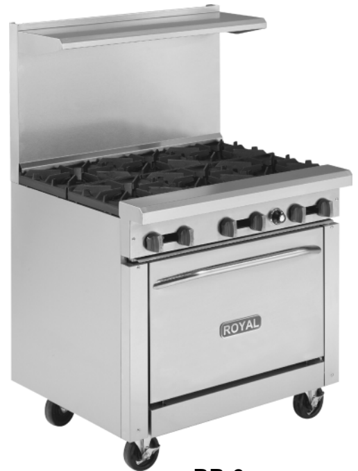
RR-6 Shown with optional casters