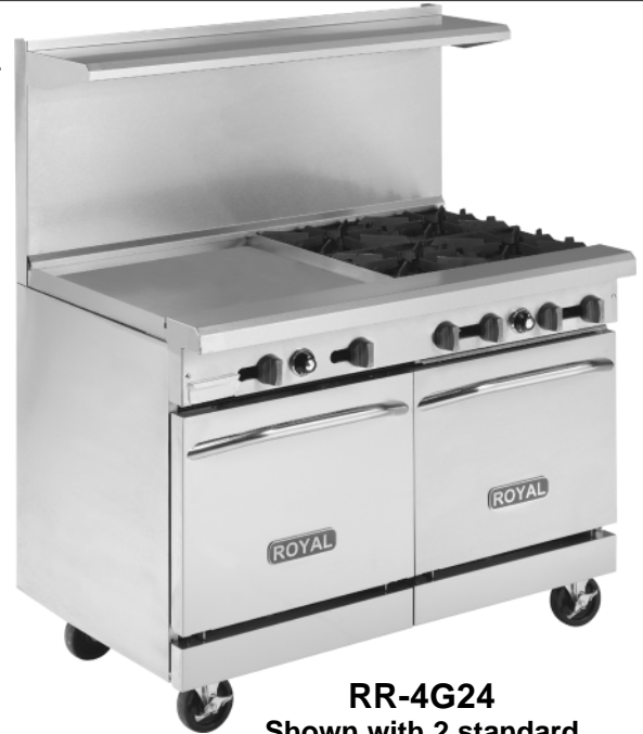
RR-4G24 Shown with 2 standard 20-1/2" wide ovens with optional casters