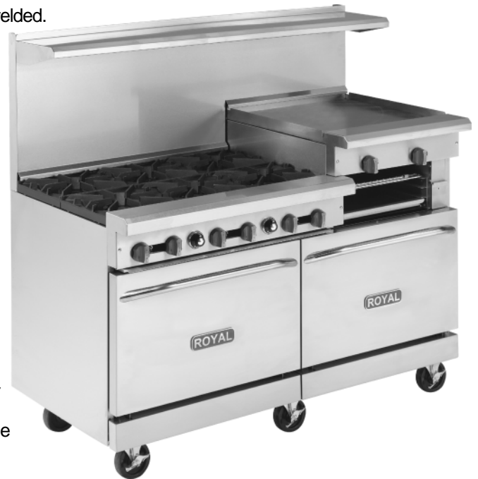
RR-6RG24 Shown With Optional Casters