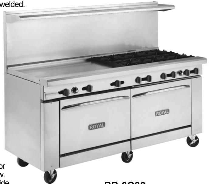
RR-6G36 Shown With Optional Casters