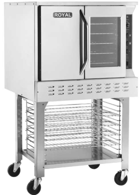
RCOD-1 Shown With Optional Rack Guides, Racks, and Casters