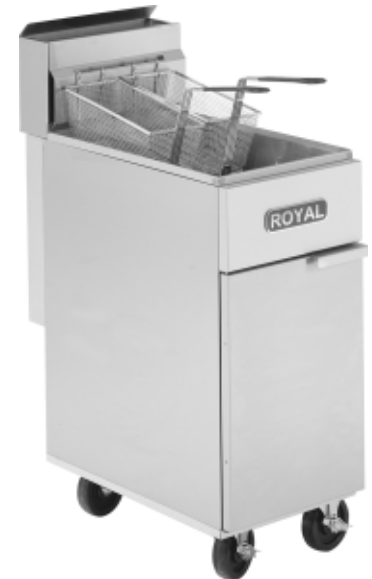
RFT-50 Shown On Optional Casters