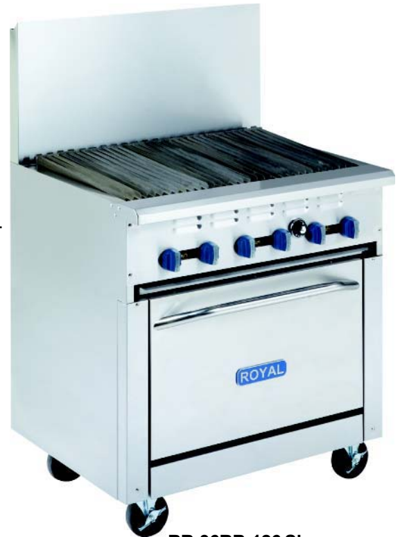
RR-36RB-126 Shown With Optional Casters