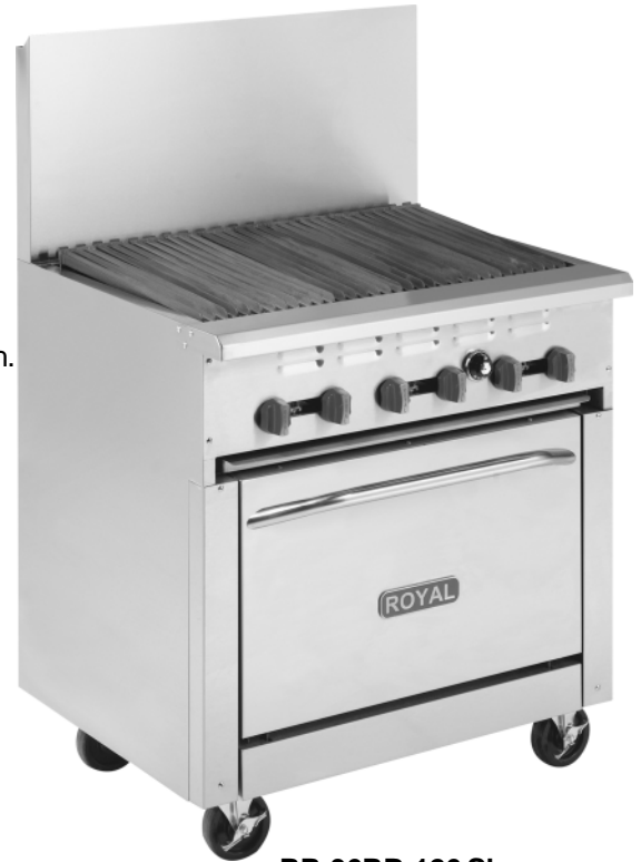
RR-36RB-126 Shown With Optional Casters